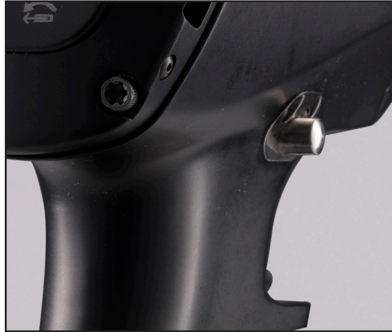
Digital jGun Drive Direction Selector