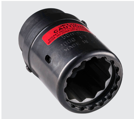
HYTORC Washer and Socket