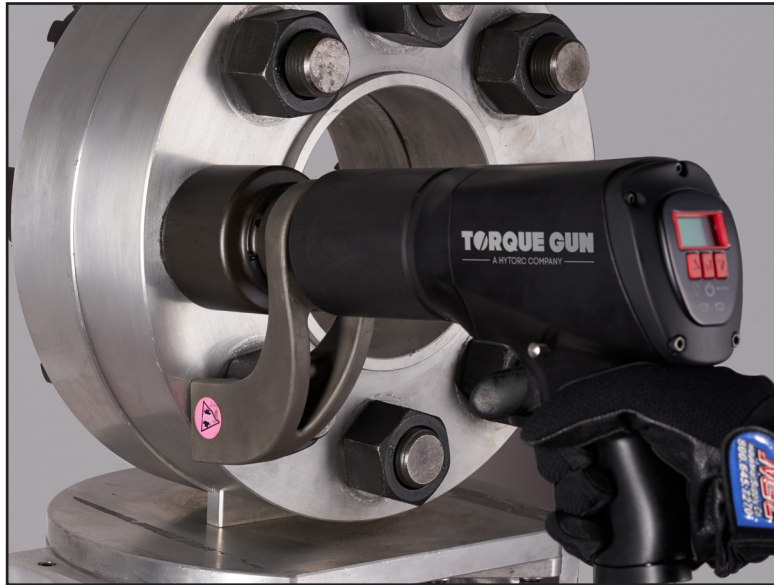
Placement of Reaction Arm