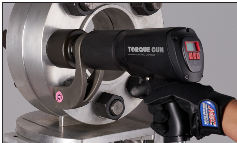
Digital jGun Operation