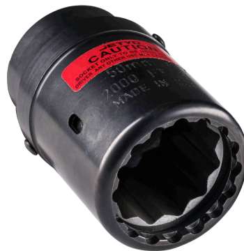
HYTORC Washer and Drive

The HYTORC Washer system can be used for all applications instead of the reaction arm.