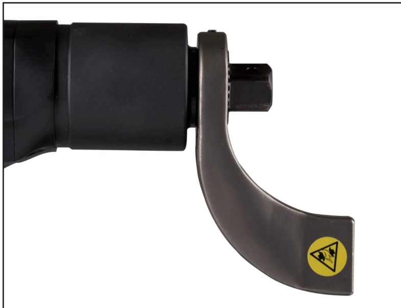
Installing a Reaction Arm