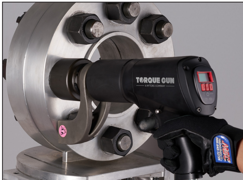
Digital jGun Operation