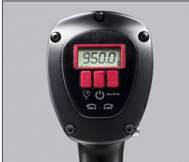
Digital jGun Display