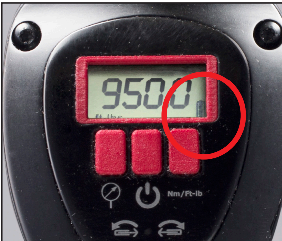
Digital jGun Battery Indicator and USB Connector